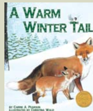
A WARM WINTER TAIL

Rhyming verses take children up a mountain to explore how animals and habitats change as they travel higher and higher above sea level.