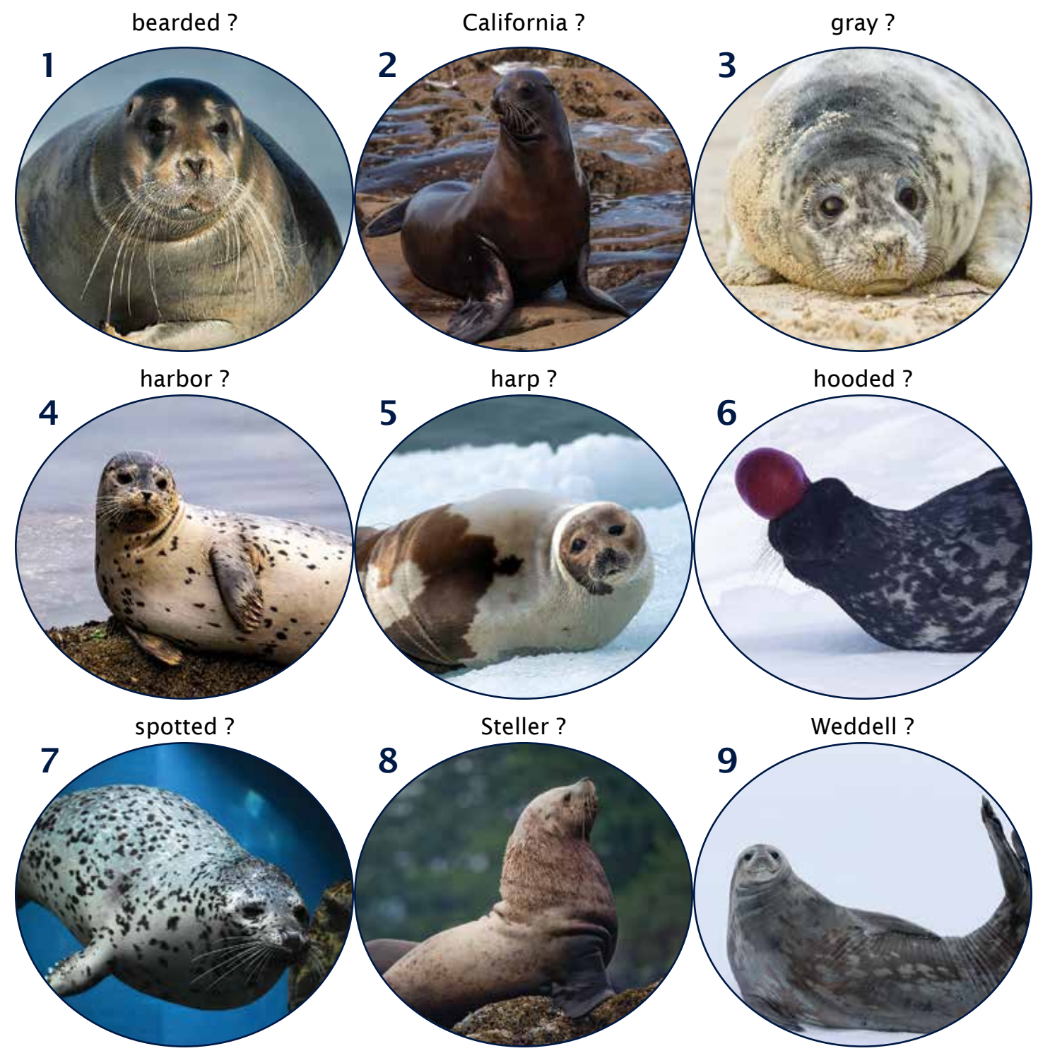
Answers: 1-seal (earless); 2-sea lion (eared), 3-seal (earless), 4-seal (earless), 5-seal (earless), 6-seal (earless), 7-seal (earless), 8-sea lion (eared), 9-seal (earless)

Using what you learned in this book, see if you can identify which are "earless" or "true" seals and which are "eared" sea lions?