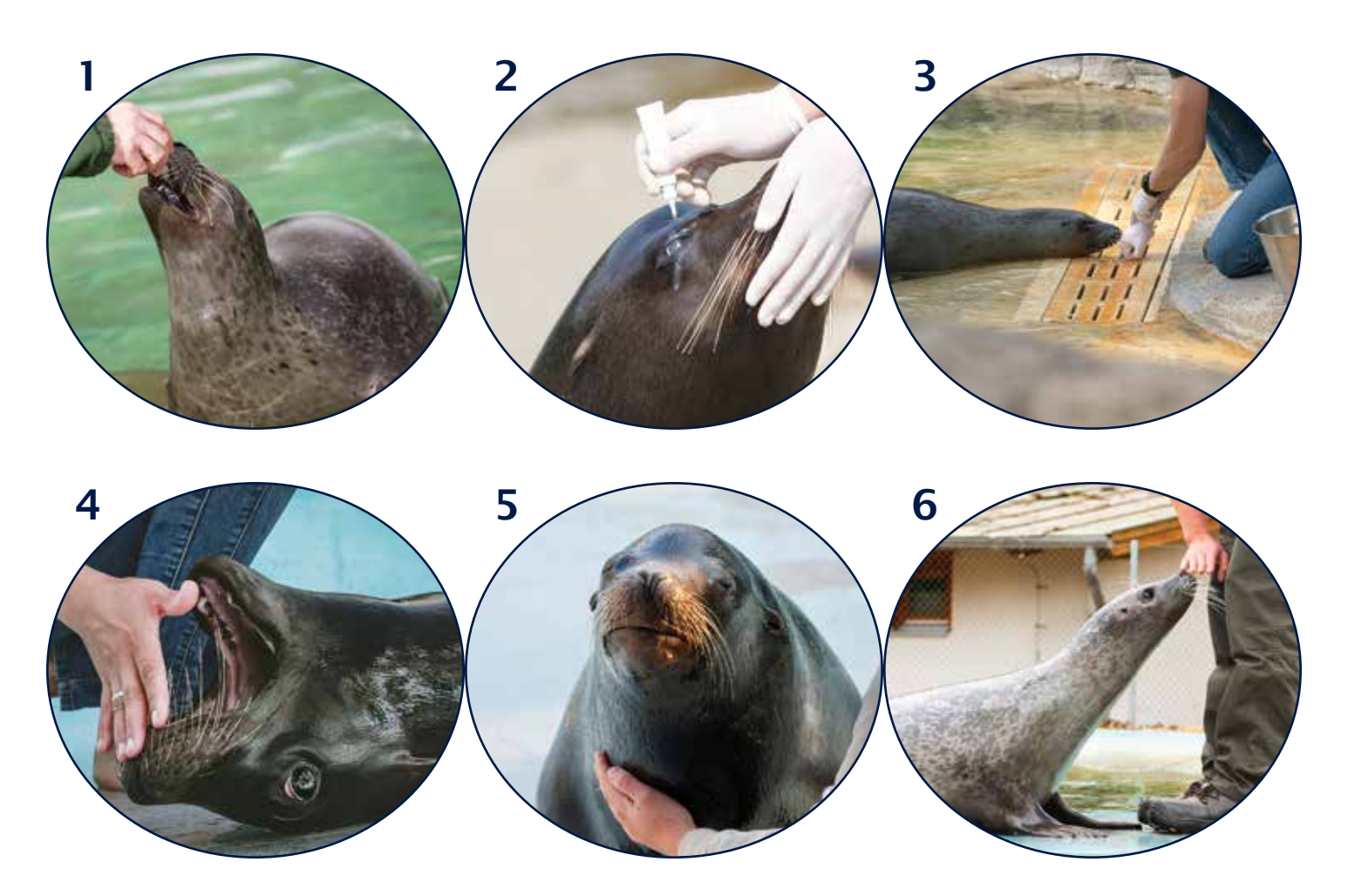
Answers: 1-training; 2-why; 3-training; 4-could be either; 5-could be either; 6-training

Which of these images show positive reinforcement training and which shows why the animal has been trained?