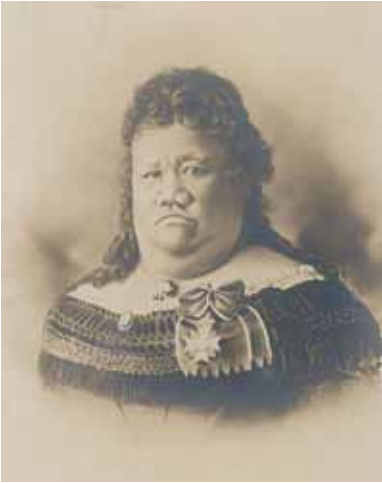
Portrait of Princess Ruth Keelikolani Wearing Ornaments (in All Her Monumentality) 1909

DOE Oceania: Amer Polynesia: Hawaiian: NM 50997 04892200, National Anthropological Archives, Smithsonian Institution