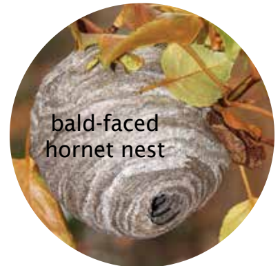
bald-faced hornet nest