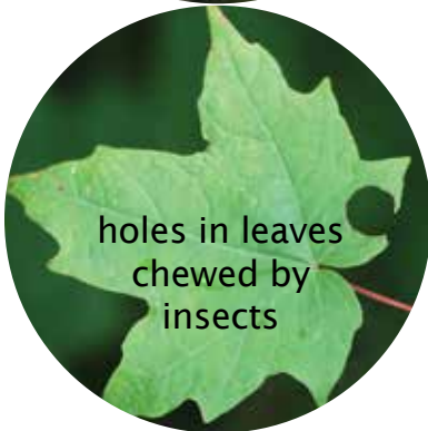
holes in leaves chewed by insects